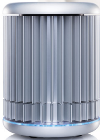
Q-16 qPCR instrument